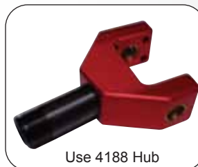
Use 4188 Hub