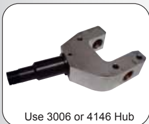
Use 3006 or 4146 Hub