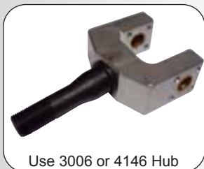
Use 3006 or 4146 Hub

Note: Spindles, King Pins and King Pin Shims Sold Separately