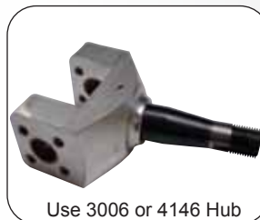
Use 3006 or 4146 Hub